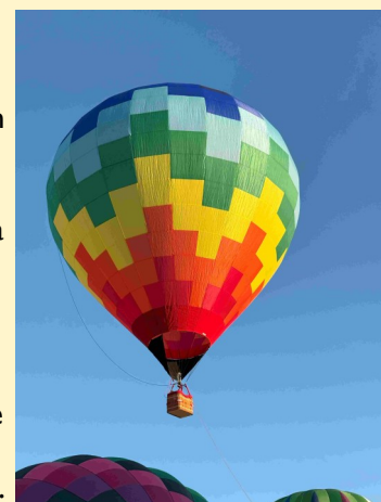
Pat Moore's R3D2