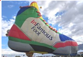
2001 Cameron 'Shoe 90