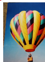
TBW FF7 & Trailer New Price