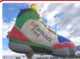
2001 Cameron 'Shoe 90